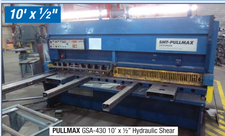
PULLMAX GSA-430 10' x 1/2" Hydraulic Shear

Bid Live ONSITE or ONLINE at BidSpotter.com