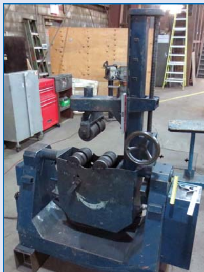
KISTLER PIPE Positioner