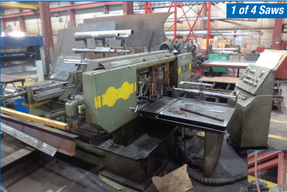
HYD-MECH S-25A Automatic Bandsaw