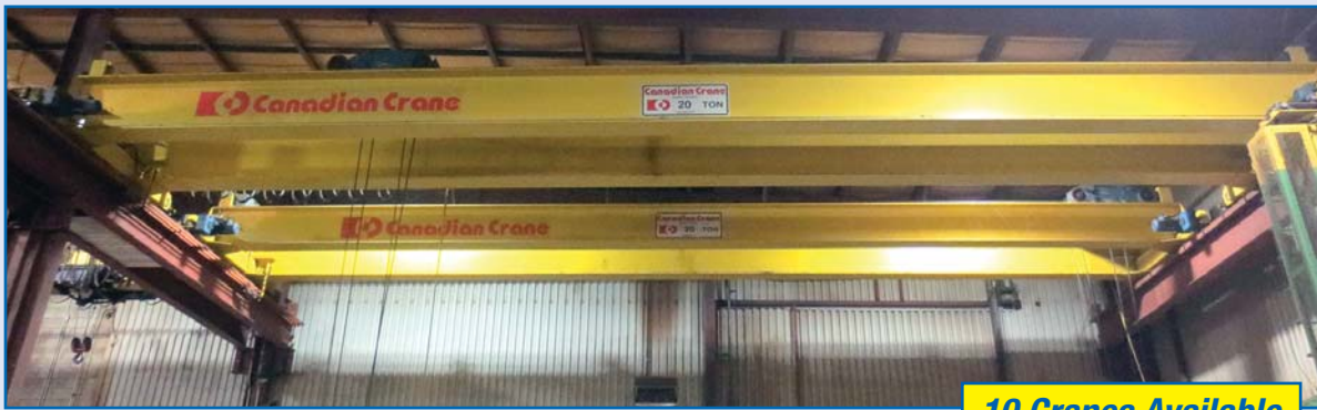
(2) CANADIAN CRANE 20 Ton, 50', Double Girder Cranes