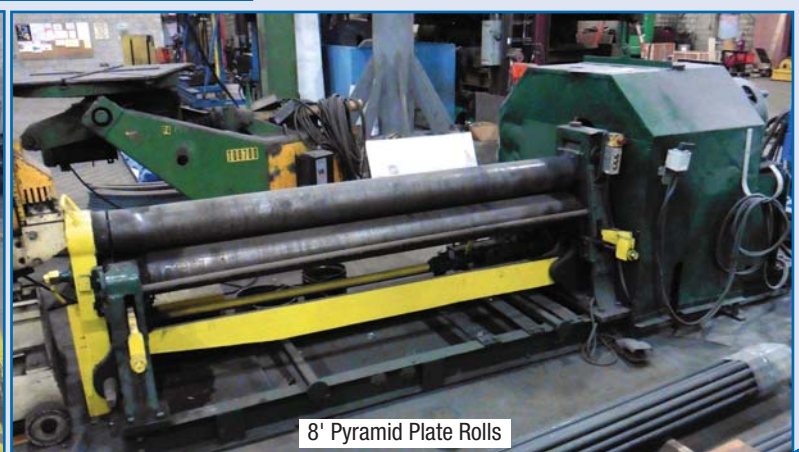
8' Pyramid Plate Rolls