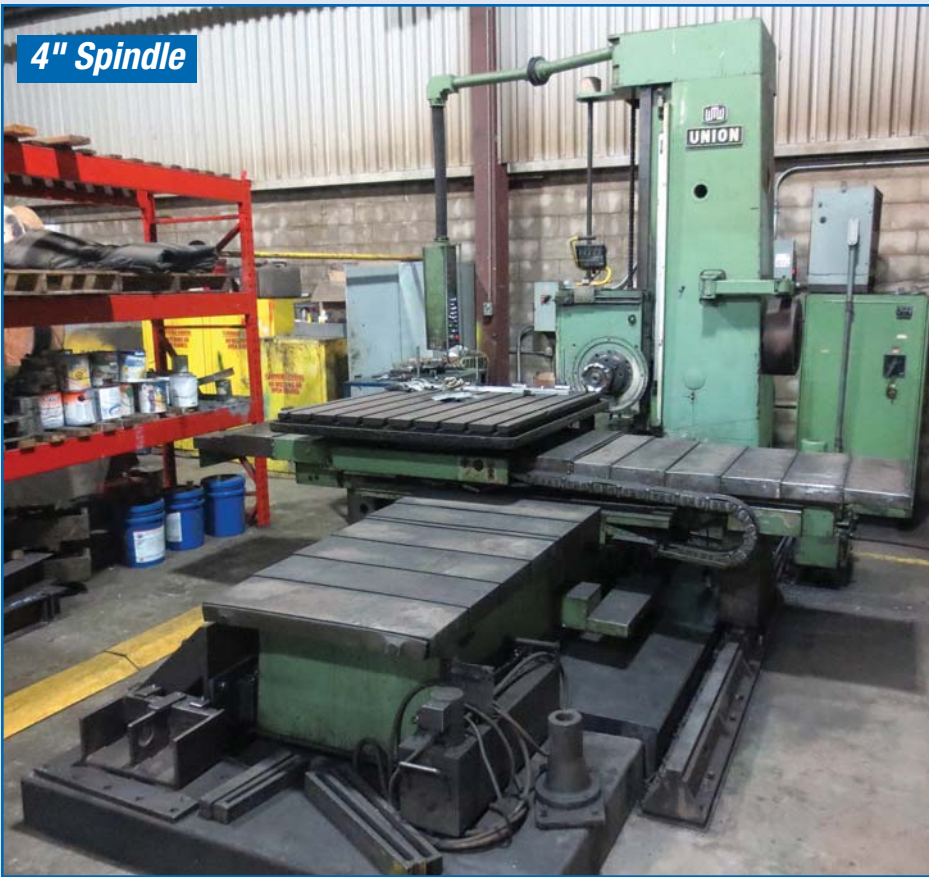
UNION 4" Horizontal Boring Mill, Model BFT-102