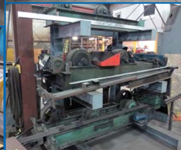
Partial View of 22 Sets of Heavy Duty Tank Turning Rolls

(2) MILLER CP-302 300 Amp DC Power Supply, Cobramatic Wire Feeder, Coolmate Water Cooler, sn LF410942C, 34397, sn KH488807