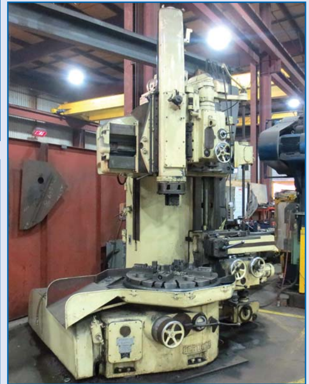
BERTHIEZ IR9320/3 Vertical Boring Mill