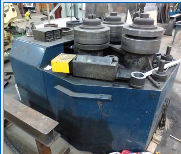
PULLMAX Angle Rolls, Model Z43, 6" x 6" x 1/2"

Also Featuring: 10 Overhead Cranes, 50', Up To 20 Ton