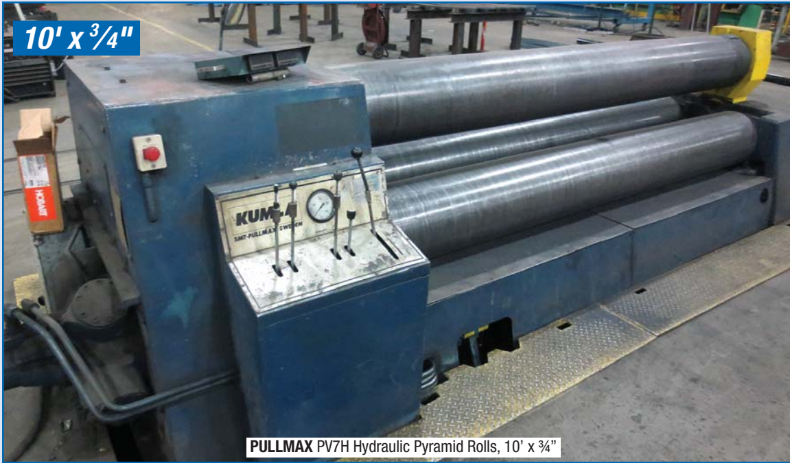
PULLMAX PV7H Hydraulic Pyramid Rolls, 10' x 3/4"