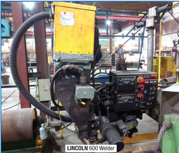
LINCOLN 600 Welder