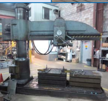
AMERICAN 8' Radial Arm Drill