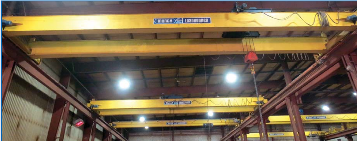
Partial View of MUNCK (2) 15 Ton, (1) 10 Ton, (5) 5 Ton 50' Cranes