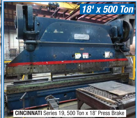
CINCINNATI Series 19, 500 Ton x 18' Press Brake

Bid Live ONSITE or ONLINE at BidSpotter.com