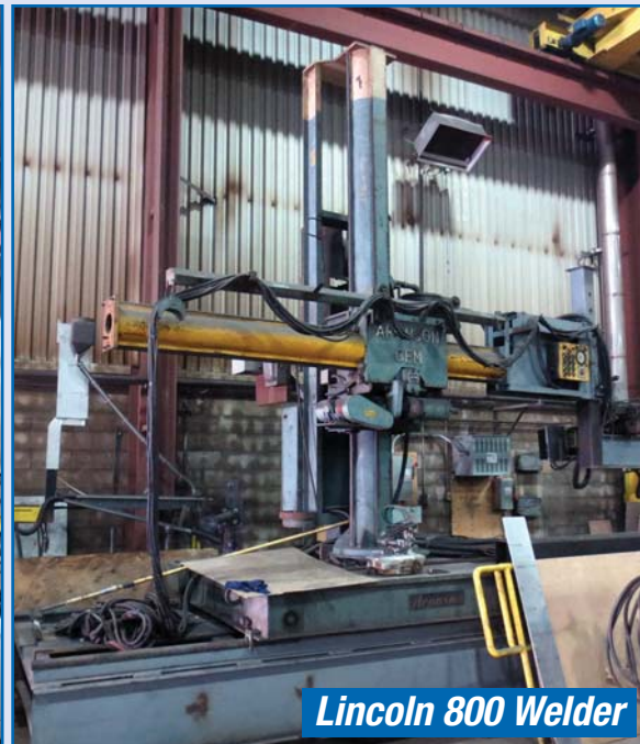
CAMTRON Welding Manipulator