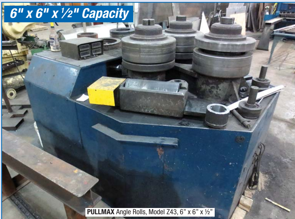
PULLMAX Angle Rolls, Model Z43, 6" x 6" x 1/2"

CINCINNATI Series 19, 500 Ton x 14' Mechanical Press Brake, 4" Stroke, Mechanical Clutch, Machined Bed and Ram, Tooling, ISB Lights, sn 34957