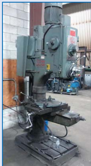
KITCHEN WALKER V2 Gear Head Drill Press