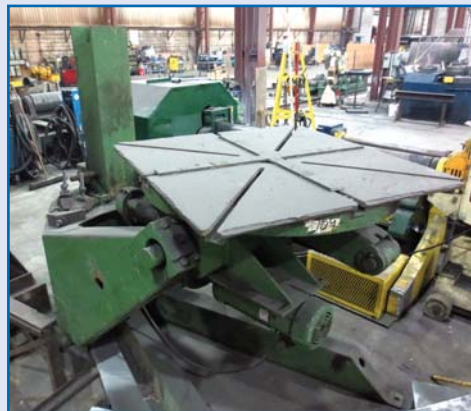
IRCO 7.5T PRUT Weld Positioner